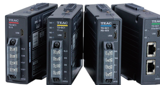
Attaches to common DIN rails