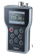
Weights only 320g (incl. batteries)