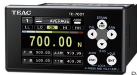
92 x 45mm Panel opening size