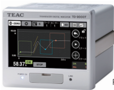
92 x 92mm Panel opening size